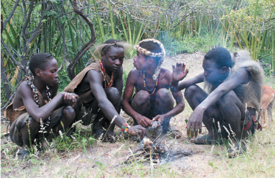
Figure 1 | Helping hands. The Hadza people of Tanzania, such as these young men who are roasting birds they have caught, rely on hunting and gathering to obtain most of their food. By studying Hadza social networks, Apicella et al.<sup>4</sup> illuminate the population dynamics that underpin the evolution of human cooperation.